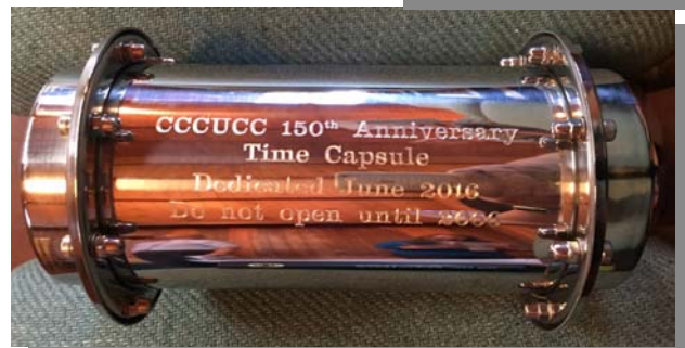
Time Capsule installed to the right of the Jesus window in fellowship hall